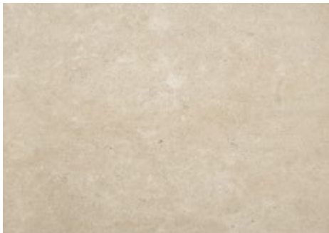
JENOLAN NANOGRIP® SLIP RESISTANCE // MEDIUM / R10 / P4 / B

Metz Jenolan series reflects the natural hues of limestone and sandstone. Irregular dots and veins evoke thoughts of shells, coral fossils and mineral deposits.