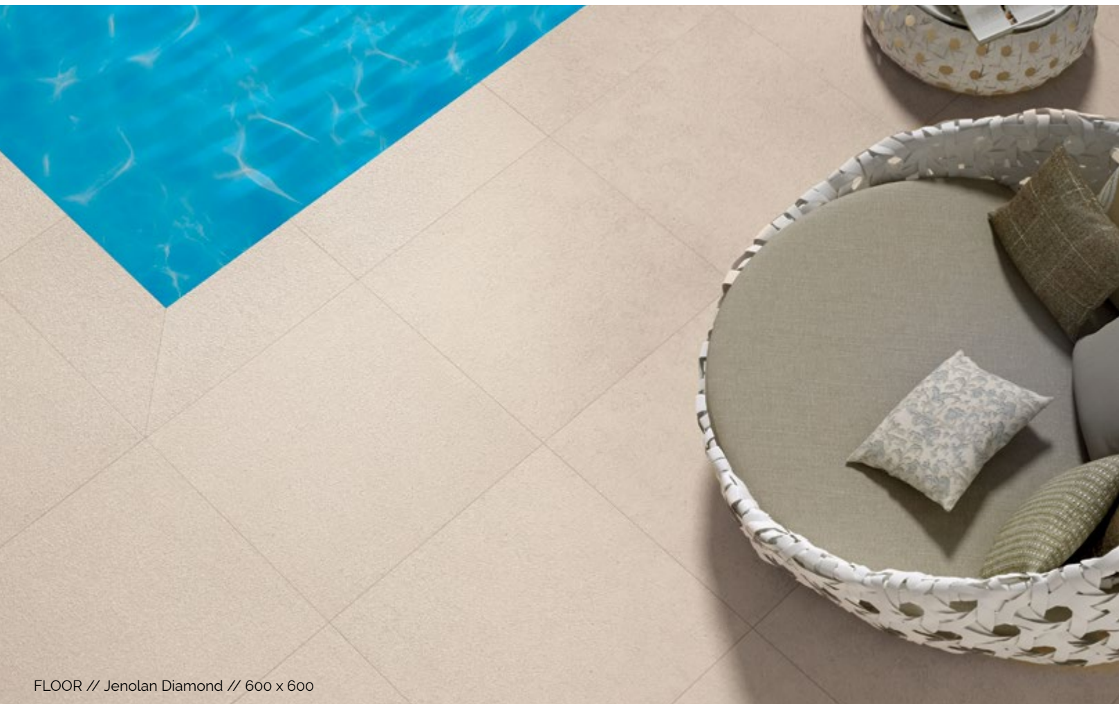
FLOOR // Jenolan Diamond // 600 x 600