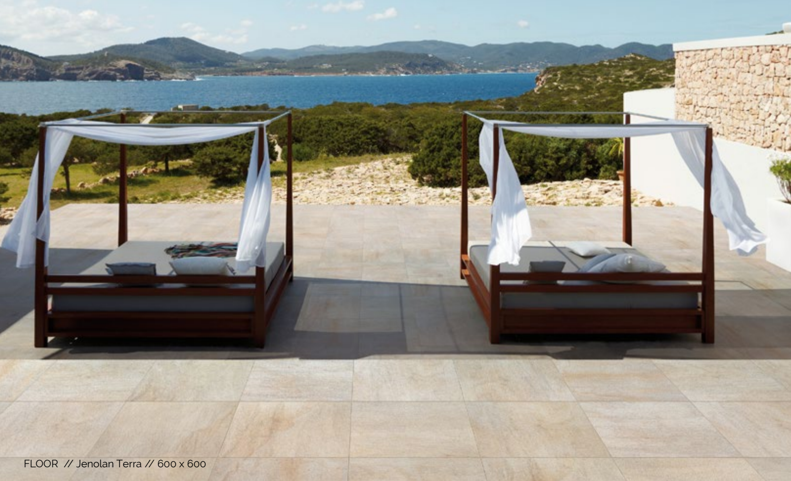
FLOOR // Jenolan Terra // 600 x 600