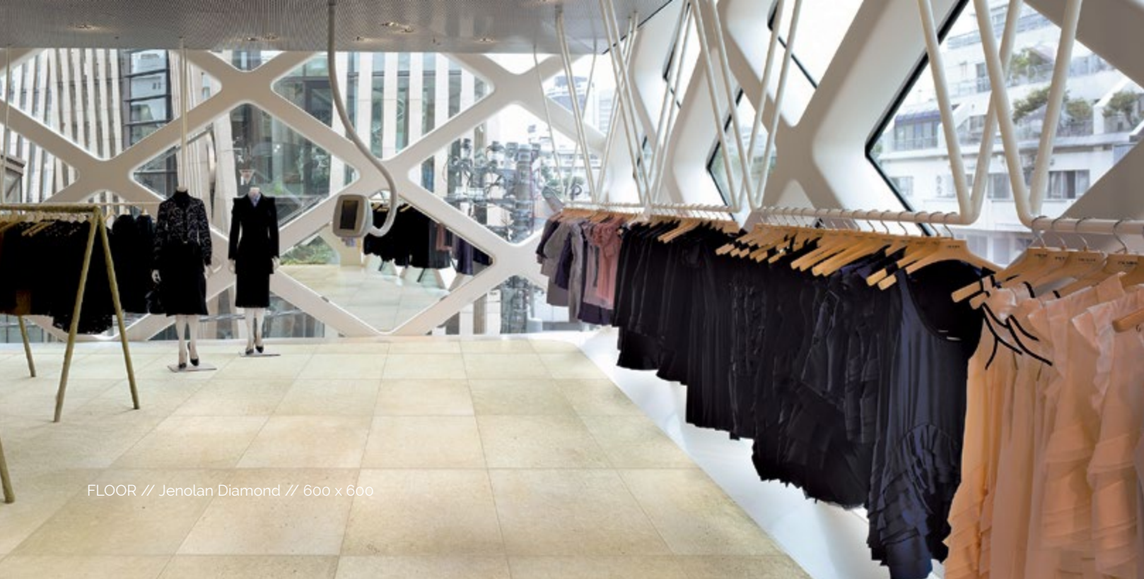
FLOOR // Jenolan Diamond // 600 x 600

Metz Jenolan series reflects the natural hues of limestone and sandstone. Irregular dots and veins evoke thoughts of shells, coral fossils and mineral deposits.