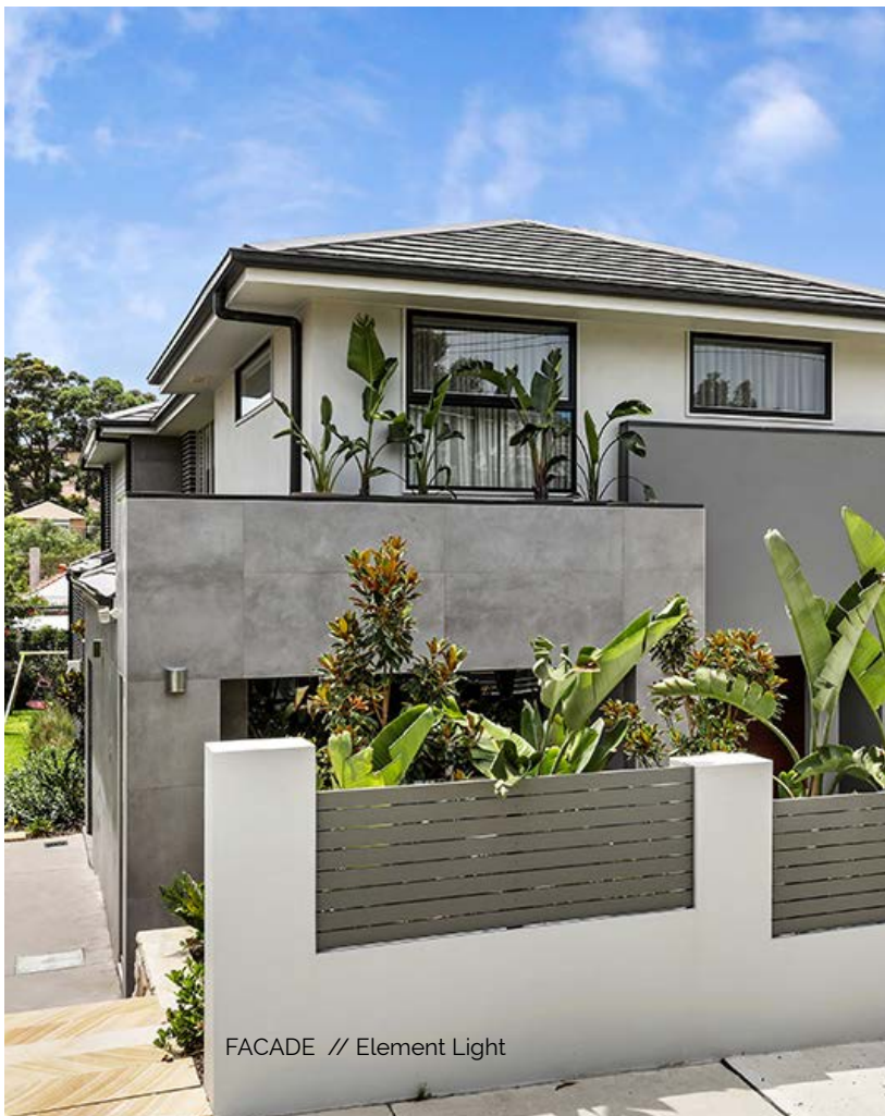
FACADE // Element Light