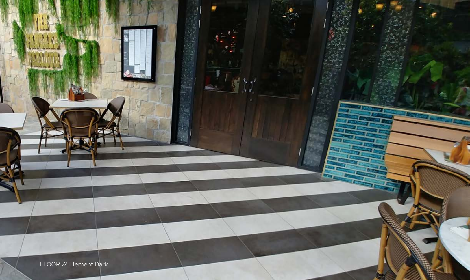
FLOOR // Element Dark