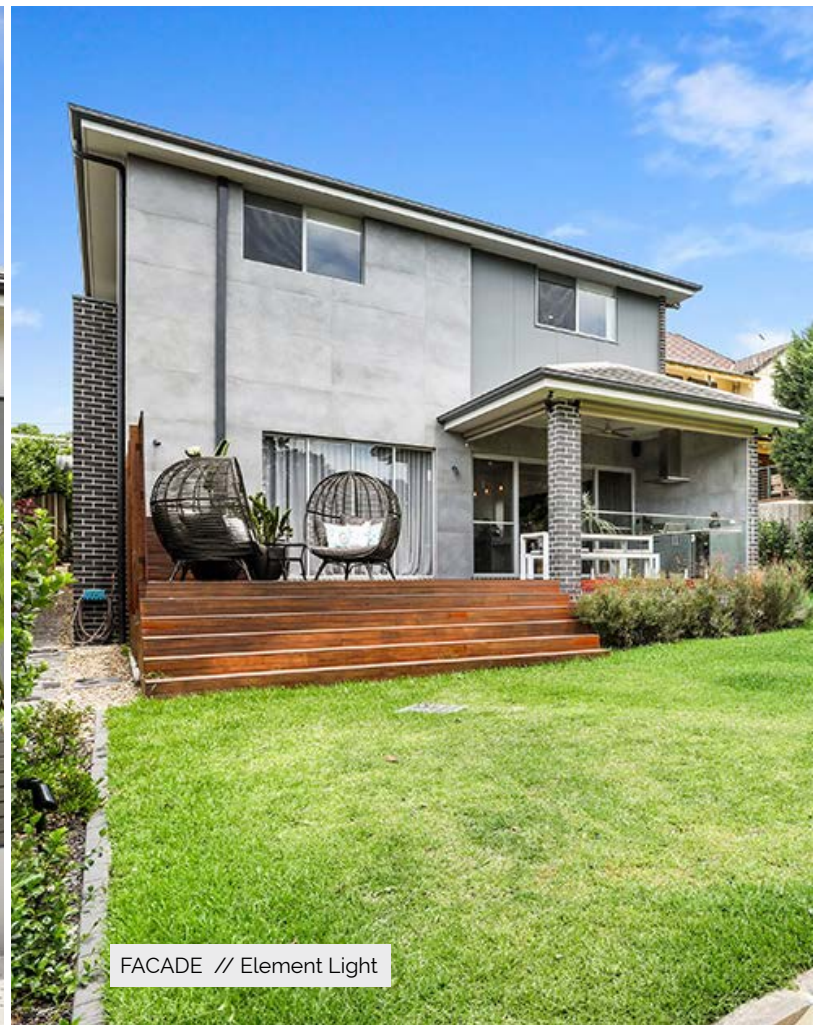
FACADE // Element Light