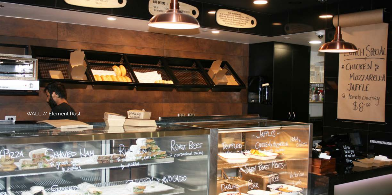
WALL // Element Rust

Metz Element series reflects contemporary urban design trends of oxidised metals in dark and light shades as well as a copper and white oxide style.