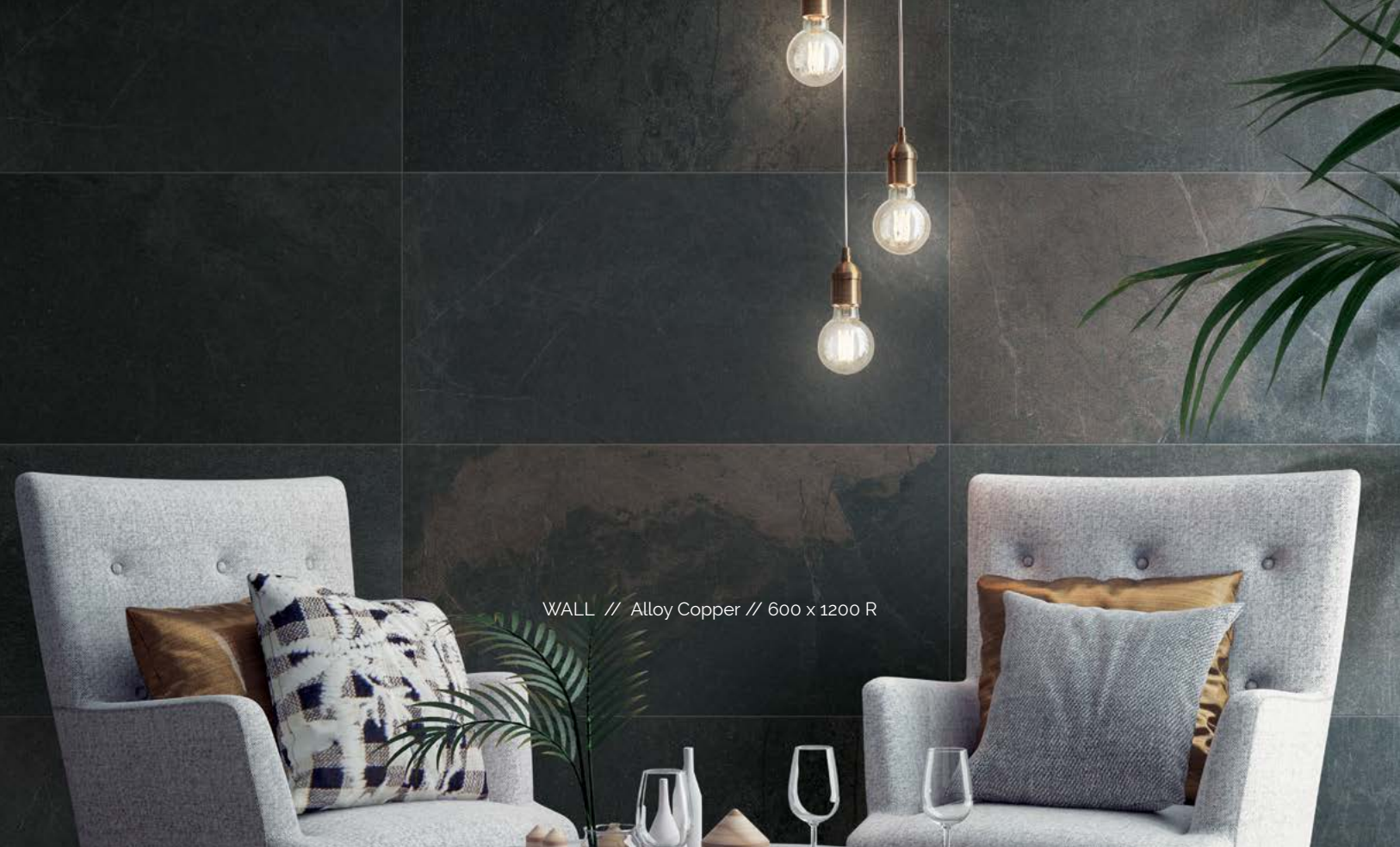
WALL // Alloy Copper // 600 x 1200 R