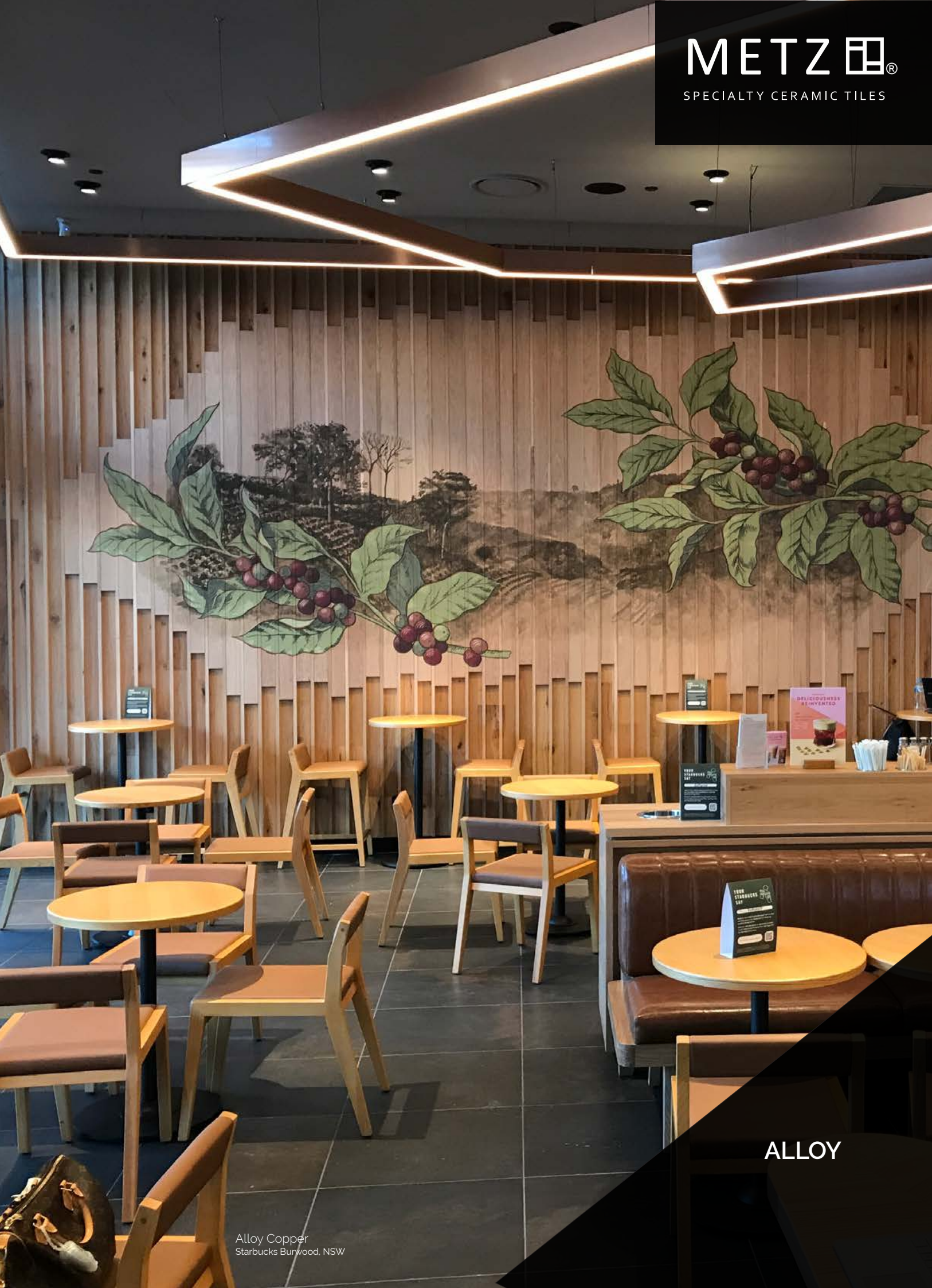
Alloy Copper Starbucks Burwood, NSW