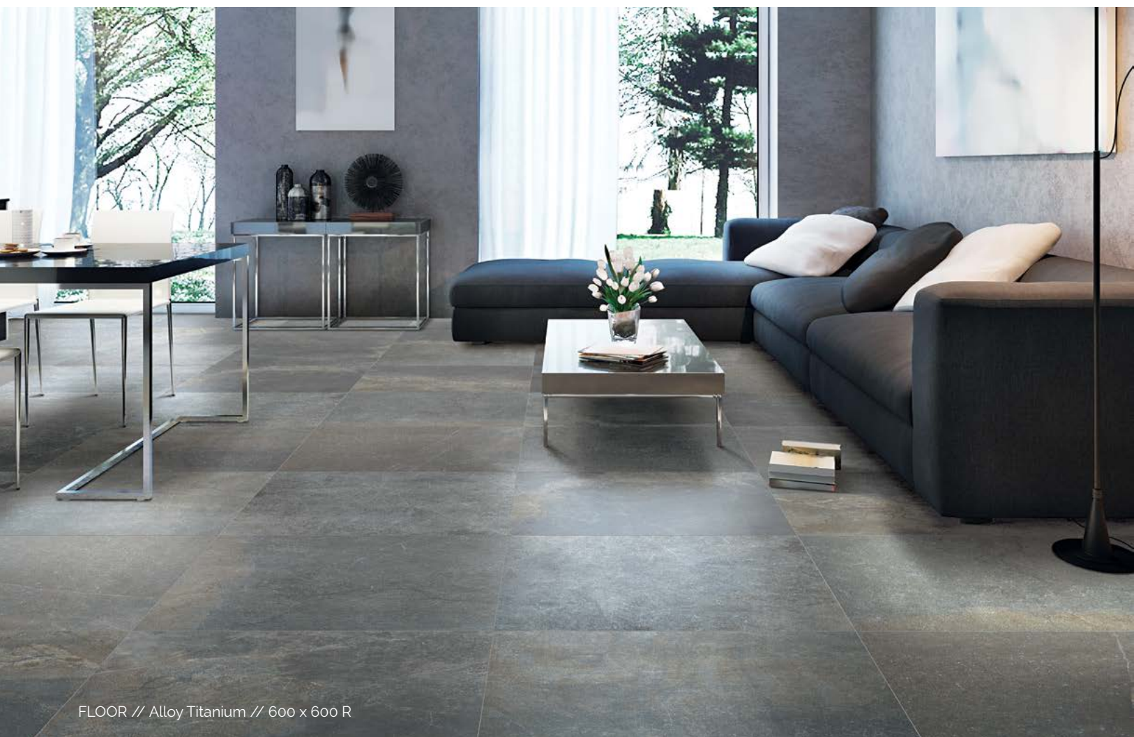
FLOOR // Alloy Titanium // 600 x 600 R