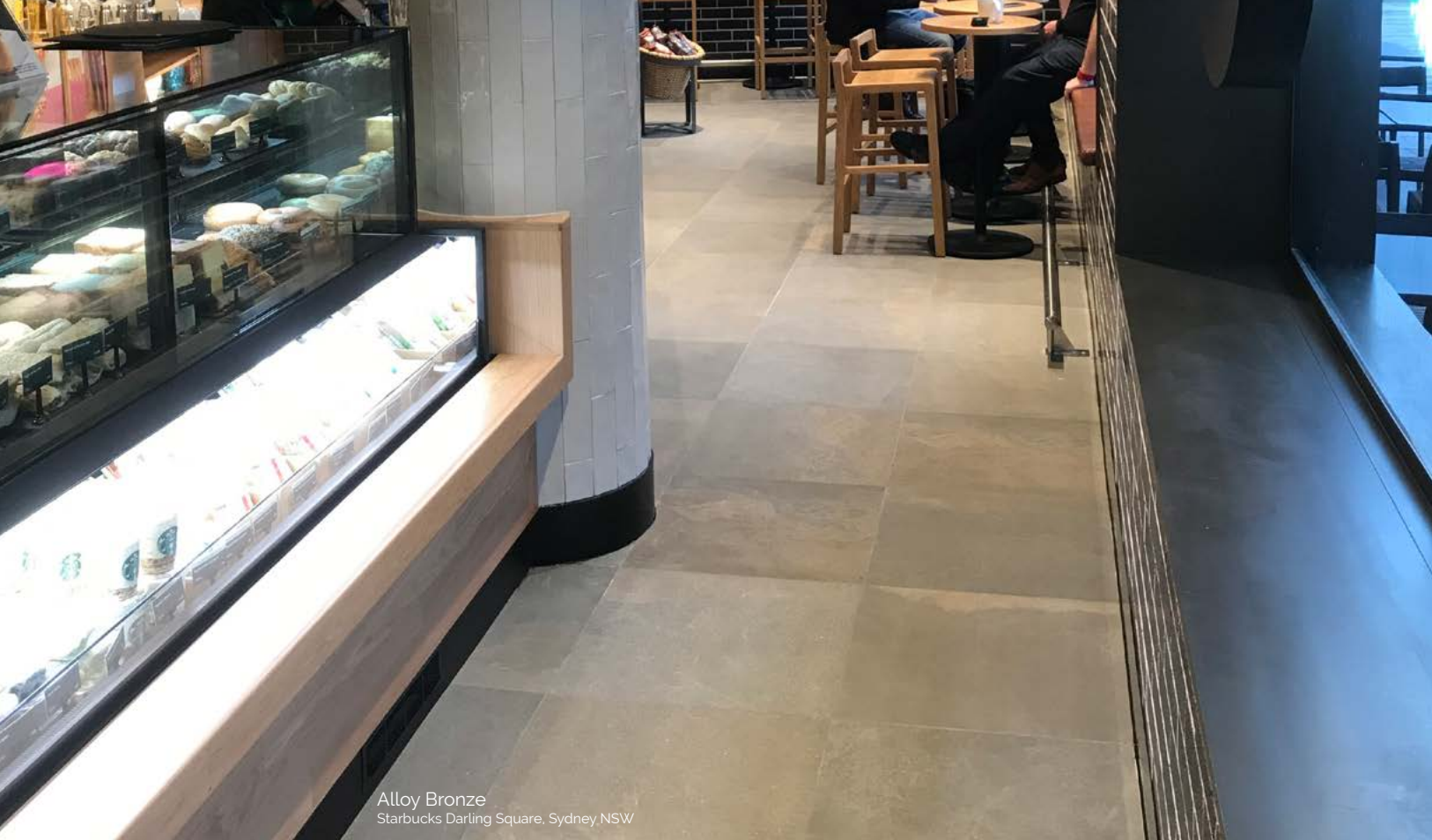
Alloy Bronze Starbucks Darling Square, Sydney NSW

Metz Alloy is a contemporary fusion of oxidised metals and cement look in 4 tones.