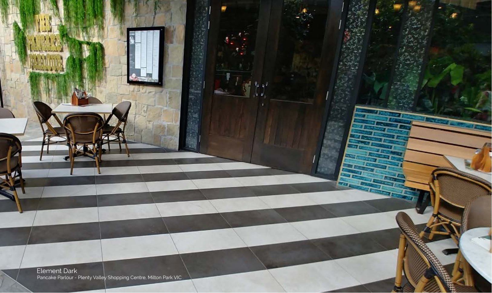
Element Dark Pancake Parlour - Plenty Valley Shopping Centre, Milton Park VIC