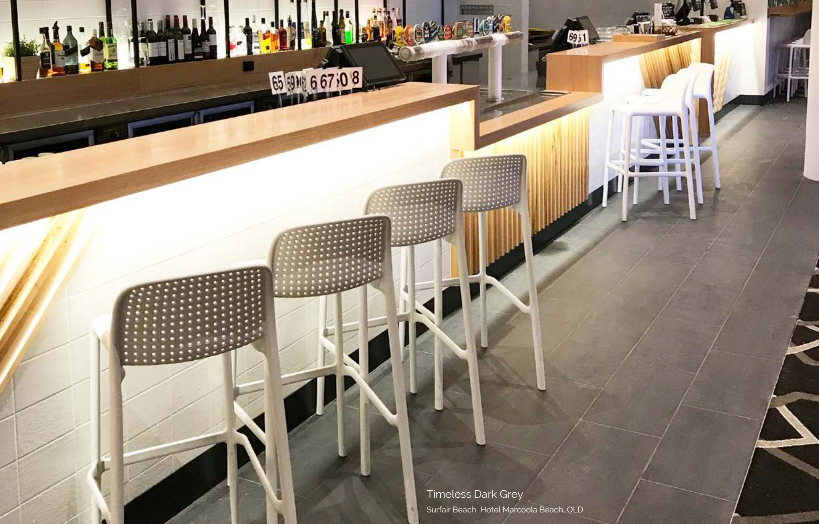
Timeless Dark Grey Surfair Beach Hotel Marcoola Beach, QLD