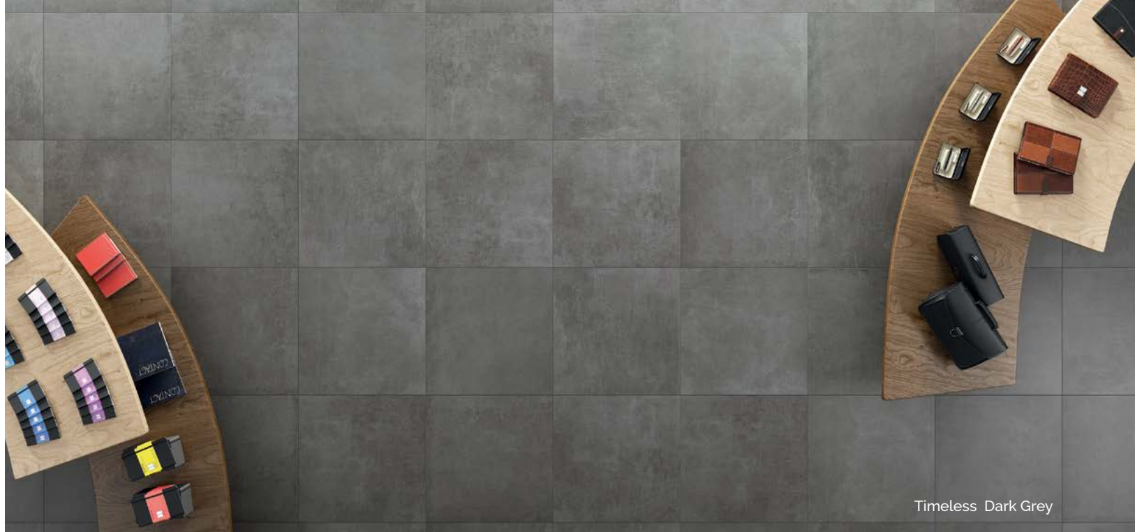
Timeless Dark Grey

Metz Timeless series is inspired by classical textured building materials such as aged bricks, shingles, and bagged render finishes. Timeless offers a unique and fashionable twist on the ever popular industrial trend, featuring porcelain tiles with a strong personality, perfect for everything from edgy contemporary décor to serene living spaces.