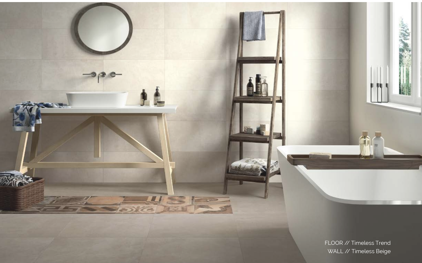
FLOOR // Timeless Trend WALL // Timeless Beige