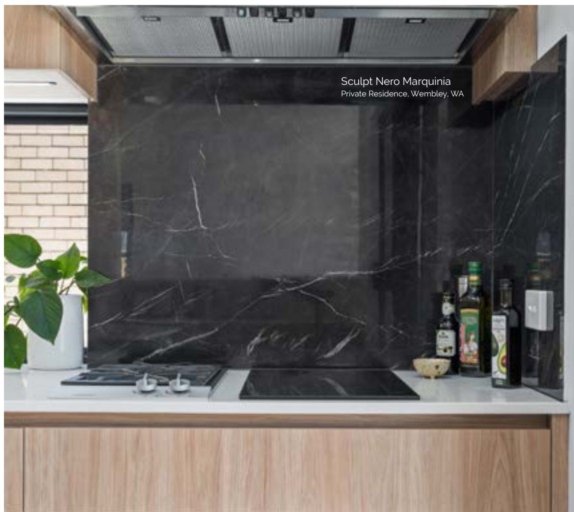
Sculpt Nero Marquinia Private Residence, Wembley, WA