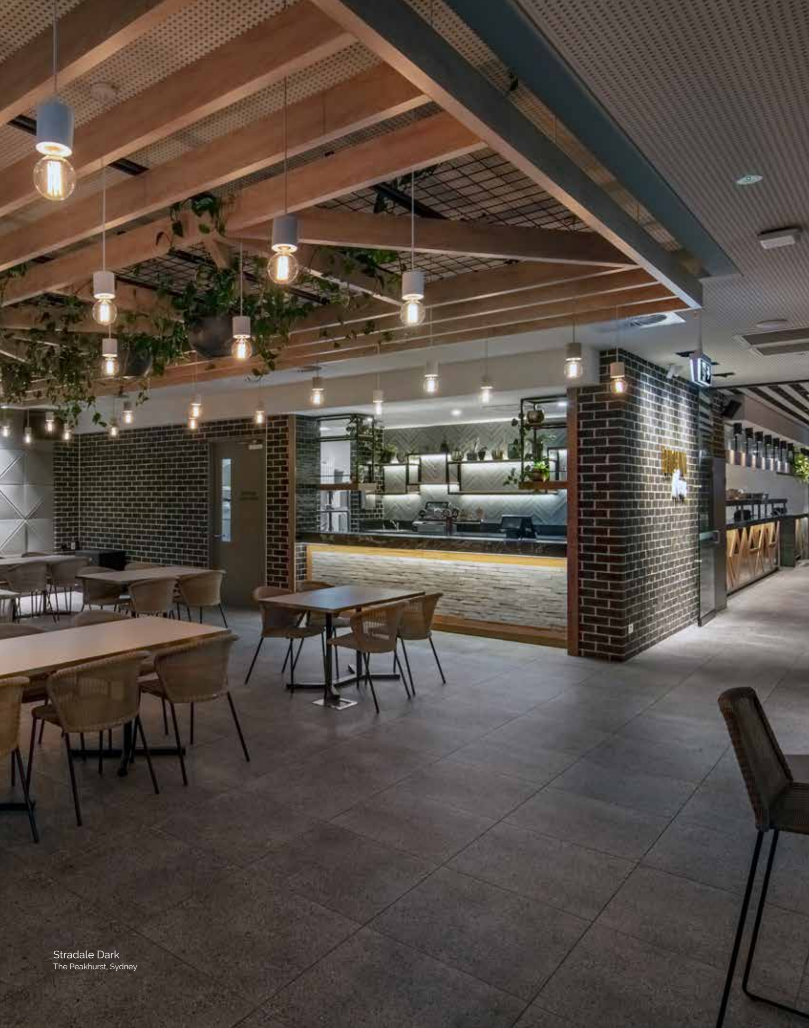
Stradale Dark The Peakhurst, Sydney