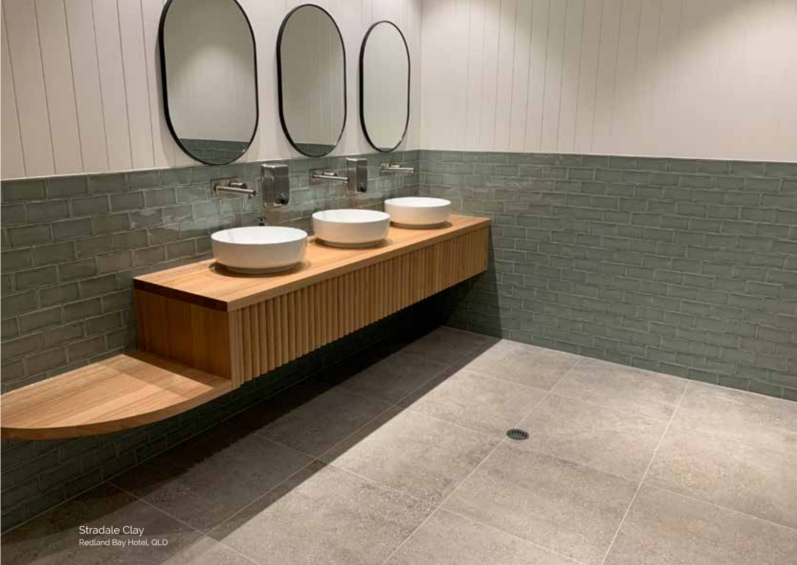
Stradale Clay Redland Bay Hotel, QLD

Metz Stradale provides an authentic ground concrete look. It features significant areas with the appearance of aggregates and cement rich sections which are subtly present to provide the perfect balance of interest and character, that allows other building elements to shine.